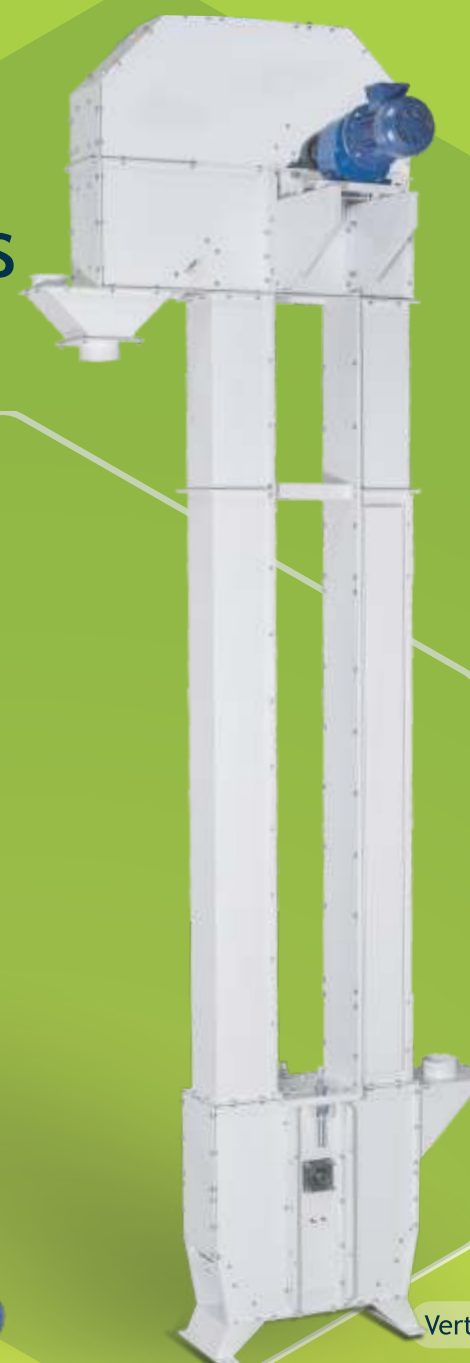
Vertical Grain Loader